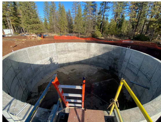
50 Foot Diameter Secondary Clarifier at the WWTP